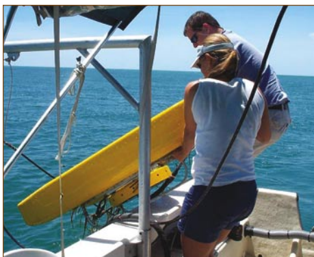
Scientists from the USGS and University of South Florida prepare the seismic sled for deployment in Tampa Bay. The sled collects seismic reflection data that can be interpreted to determine the subsurface geology of Tampa Bay.

Contamination from groundwater sources is a major concern in Tampa Bay. Some scientists estimate that 20 percent of the fresh water flowing into Tampa Bay comes from groundwater, although it is unknown where groundwater seepage occurs. Three different aquifer systems sit beneath Tampa Bay, and because of their proximity to the seafloor, two of them might be sources of groundwater entering the bay. Seismic surveying aims to identify the location and depth of shallow aquifers beneath Tampa Bay.