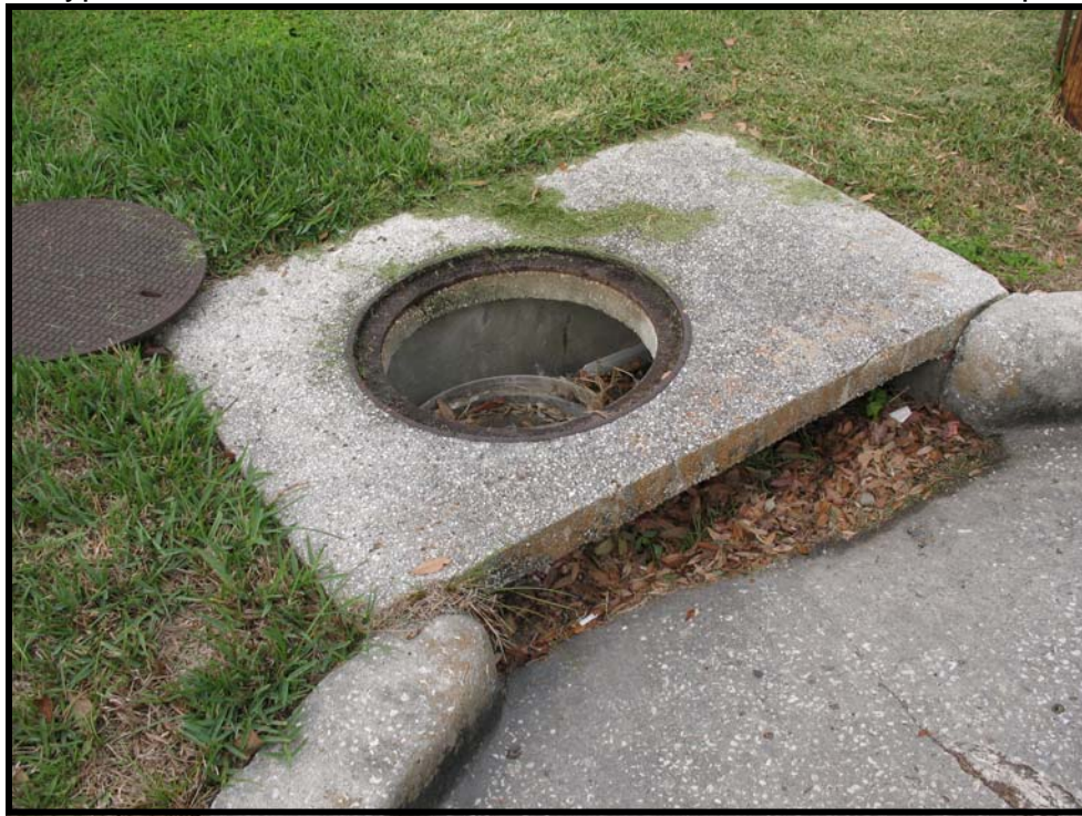
Typical catchbasin with throated inlet and manhole cover on top.

The following photos taken during the servicing of Bay Crest are typical of all the inlets and the Curb Inlet Baskets in the area.